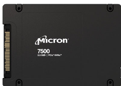
Micron 7500 NVMe SSD (U.3/U.2), 15mm

The 7500 SSD is a versatile solution that delivers the performance required by complex and critical business workloads.